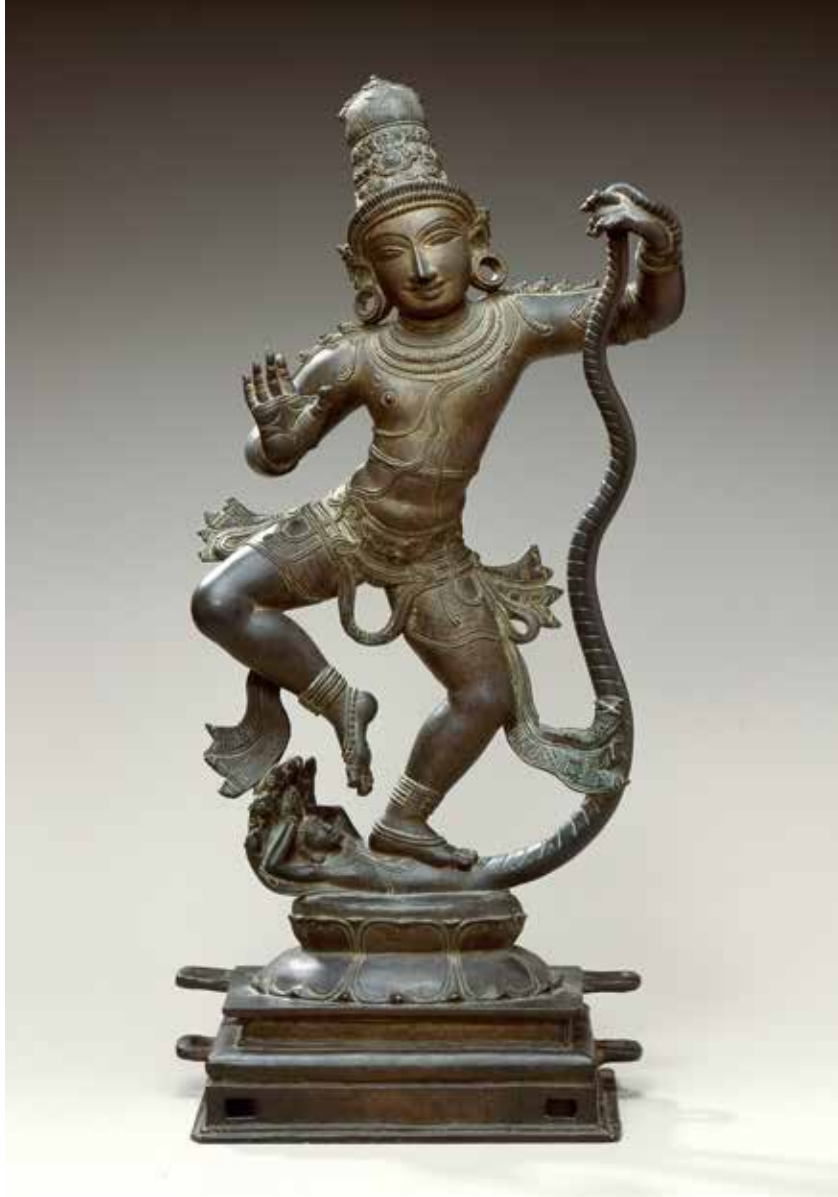
5.5. Krishna Overcoming the Serpent Kaliya. Sundaraperumalkoil, Tamil Nadu, Vijayanagara period, ca. 15th century. Bronze, 66 × 33 × 22.9 cm. Courtesy of the Asian Art Museum of San Francisco, The Avery Brundage Collection (B65B72)

subjects, representations of the Hindu deity Vishnu, especially his incarnations as Krishna and Rama (key figures in the Mahabharata and the Ramayana , respectively). Images of the Hindu deities were also widely used in public ritual processions on the occasion of religious festivals (fig. 5.5). Additionally, the Indian epics and other Sanskrit myths were brought to life in both public and private settings through recitation, dance, and music.