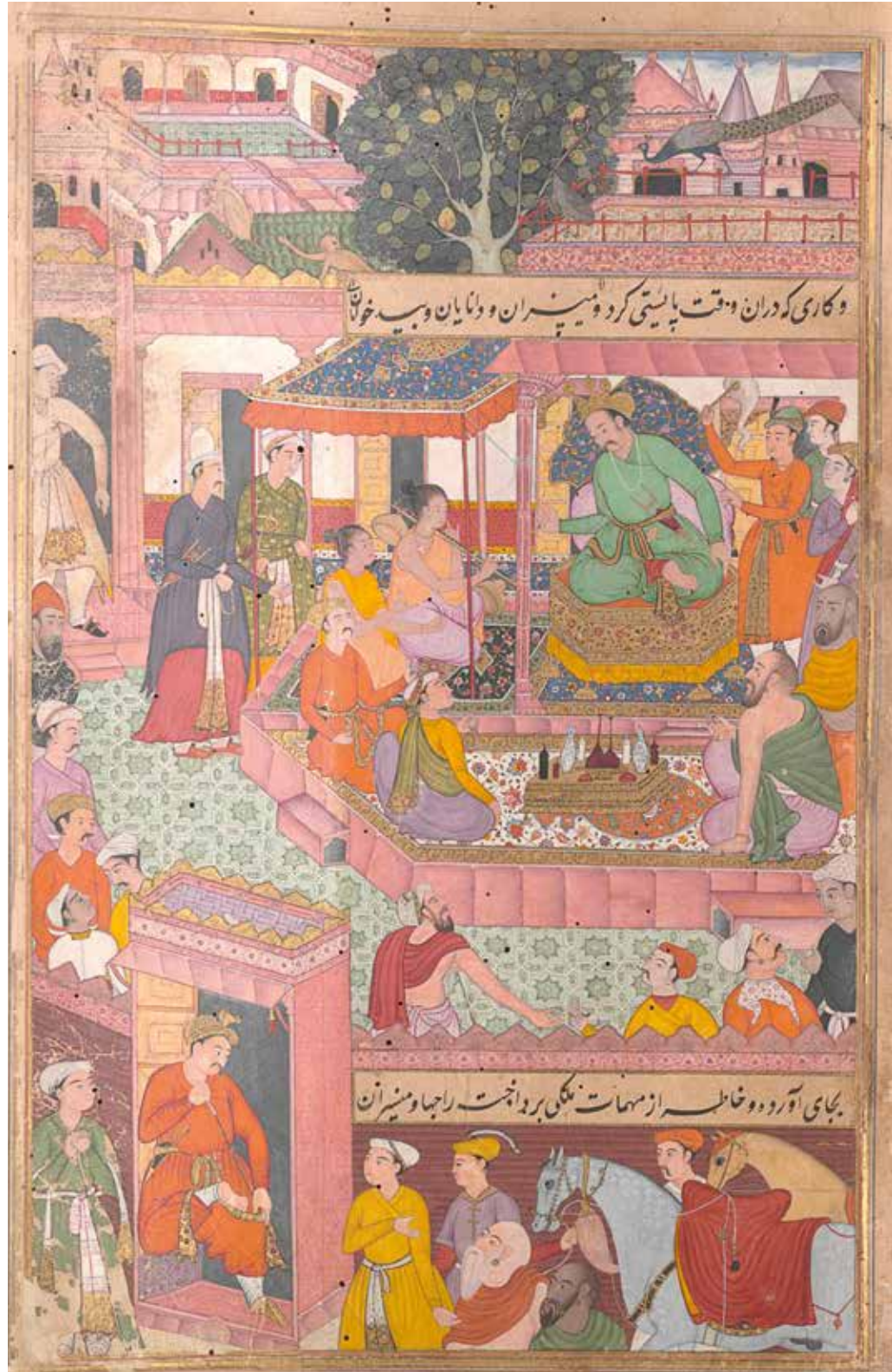
5.9. Rama Meets His Teenage Sons , from the Ramayana . Mughal India, 16th century. Opaque watercolor, ink, and gold on paper. The Museum of Islamic Art, Doha (MS.20.2000, p. 906)