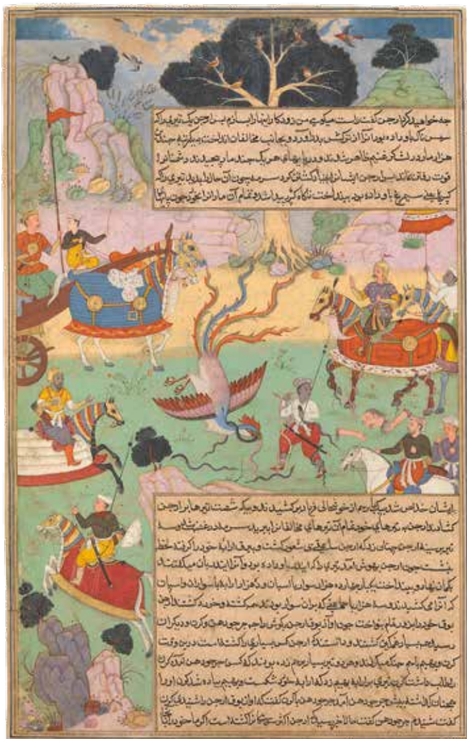
5.6. Fighting Arjuna, Susharma Unleashes the Suparna Weapon which Invokes Garuda , from the Razmnama (Book of War). Mughal India, ca. 1616–17. Opaque watercolor, ink, and gold on paper, 37.7 × 22 cm. The Metropolitan Museum of Art, New York, Rogers Fund, 1955 (55.121.34)

guidance to the Hindustani sovereign Akbar. 66 The Mahabharata project is thus best understood within the wider context of the preoccupation at Akbar's court with regularly commissioning new histories (e.g., multiple accounts of Humayun's reign, Tarikh-i khandan-i Timuriyya , Tarikh-i alfi , Chingiznama , and Akbarnama ) as well as manuscripts and translations of older chronicles (e.g., Jami' al-tawarikh and Baburnama ). Many of these works strategically situated the Mughal dynasty within a ruling lineage, such as that of Genghis (Chinggis) Khan or the line of Timur (Tamerlane). The Mahabharata (retitled Razmnama ) cast the Mughals as following from the long, glorious ranks of India's pre-Islamic kings.