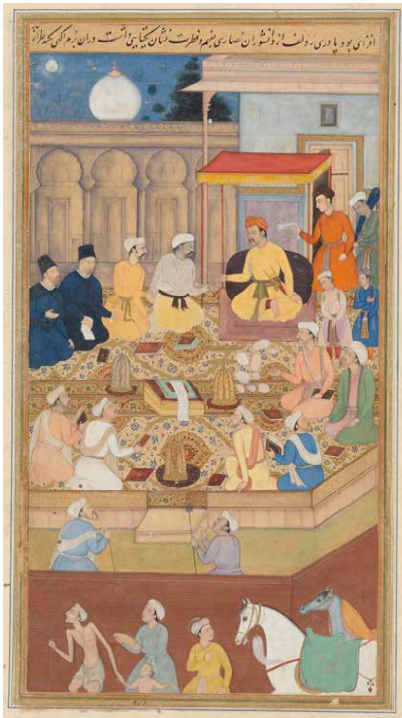
5.1. Narsingh (attrib.), Akbar Presiding over Discussions in the Ibadatkhana , from the Akbarnama (Book of Akbar). Mughal India, ca. 1600–1603. Opaque watercolor, ink, and gold on paper, 43.5 × 26.8 cm. Trustees of the Chester Beatty Library, Dublin (In 03, fol. 263b)

Khan-i Khanan (d. 1626), a highly placed general in the imperial army under the emperors Akbar and Jahangir (r. 1605–27), for example, employed poets working in multiple languages and commissioned his own illustrated copies of the Mughal versions of the Mahabharata and the Ramayana . 17 His atelier was highly esteemed, and artists often entered his workshop from the Mughal court (rather than following the more common trend of moving from sub-imperial to royal employment). 18 Abd al-Rahim was himself an accomplished poet in several languages, including Hindavi (premodern Hindi). 19 He also translated the Baburnama , the memoirs of Akbar's grandfather, from Chagatai Turkish into Persian and presented it to Akbar in 1589. 20